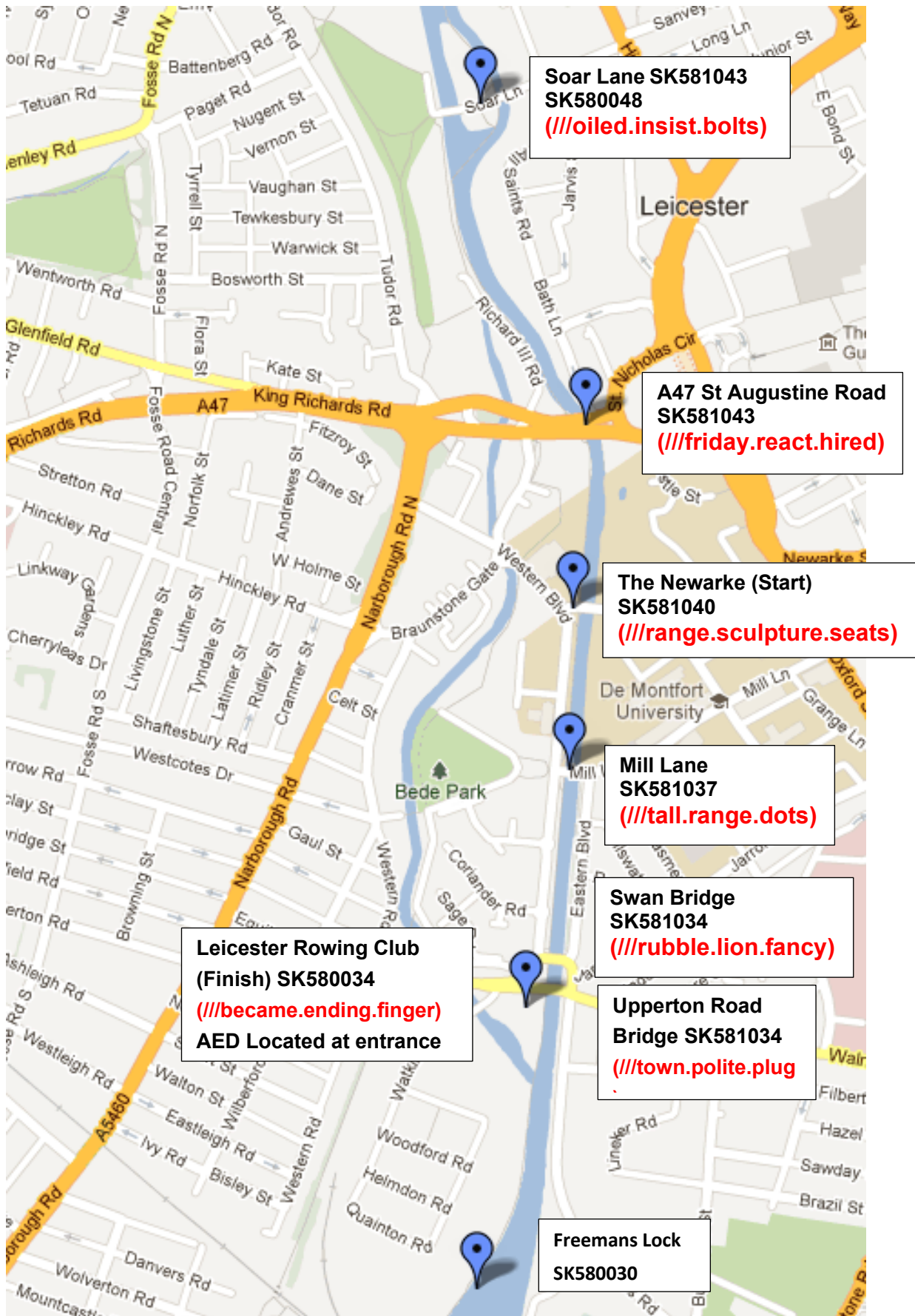
Fig 1 Access Points.