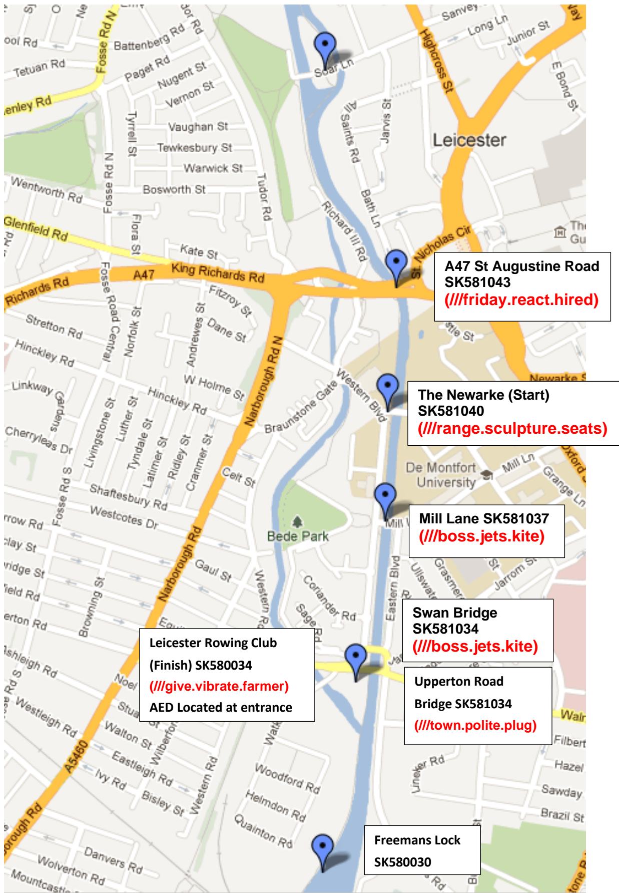
Fig 1 Access Points.