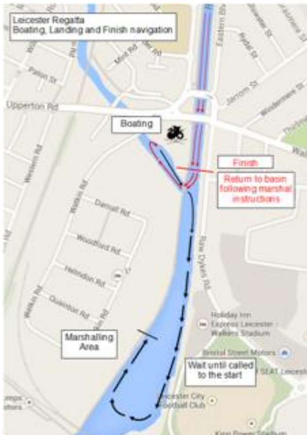
Fig D-1 Circulation pattern after coming out of the boating area

D1.3.3 Marshals will instruct you when to row down to the start. Fig D-2 Compressed Plan showing Boating Area and Regatta Course is a useful indication of the location of the boathouse, boating area and regatta course. After you have passed through the bridge at the start, (Newarke Bridge) a marshal will be lining crews up in race order and you will be instructed when to spin by the marshal.