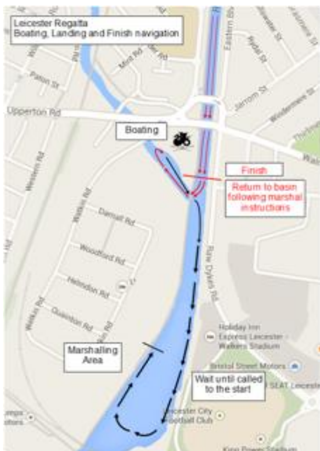
Fig D-1 Circulation pattern after coming out of the boating area

D1.3.3 Marshals will instruct you when to row down to the start and a red/green marker (lollipop) on the finish scaffold will also signal when it is safe to row down the course. Fig D-2 Compressed Plan showing Boating Area and Regatta Course is a useful indication of the location of the boathouse, boating area and regatta course. After you have passed through the bridge at the start, (Newarke Bridge) a marshal will be lining crews up in race order and you will be instructed when to spin by the marshal.